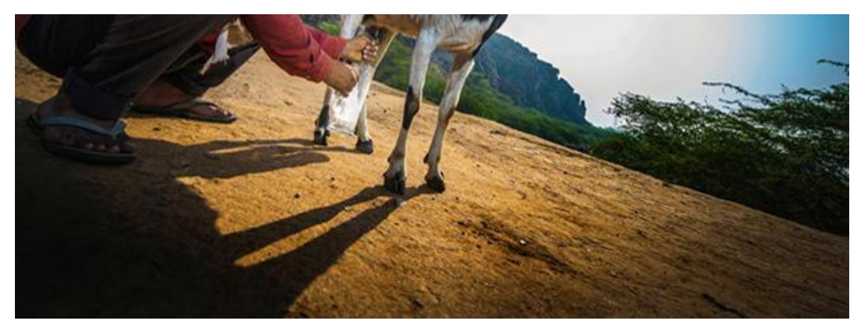
A goat being milked on Courtyard Farms.