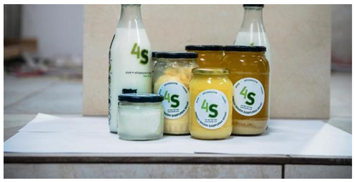
Products from 4S Foods.