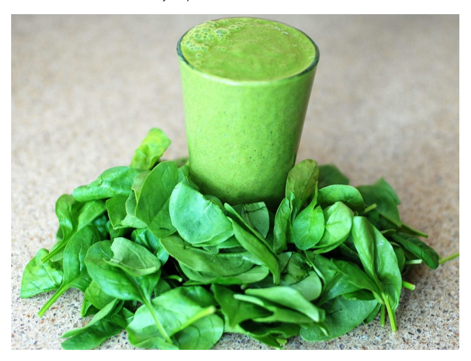
(Visit the SHARAN website for many more healthy vegan recipes like these.)