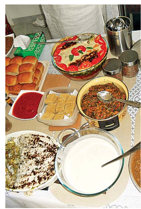
From top: Carrot Hesarubele Kosumbari: the spread at the potluck lunch in Mumbai

METHOD Steam tofu in a steamer for 3-5 minutes; let it cool for a bit. Add all the ingredients to your whipper and whip together. The mayonnaise is ready to eat. Variation: You can also 1 tsp of mustard to it to give it a twist (especially good for your liver)