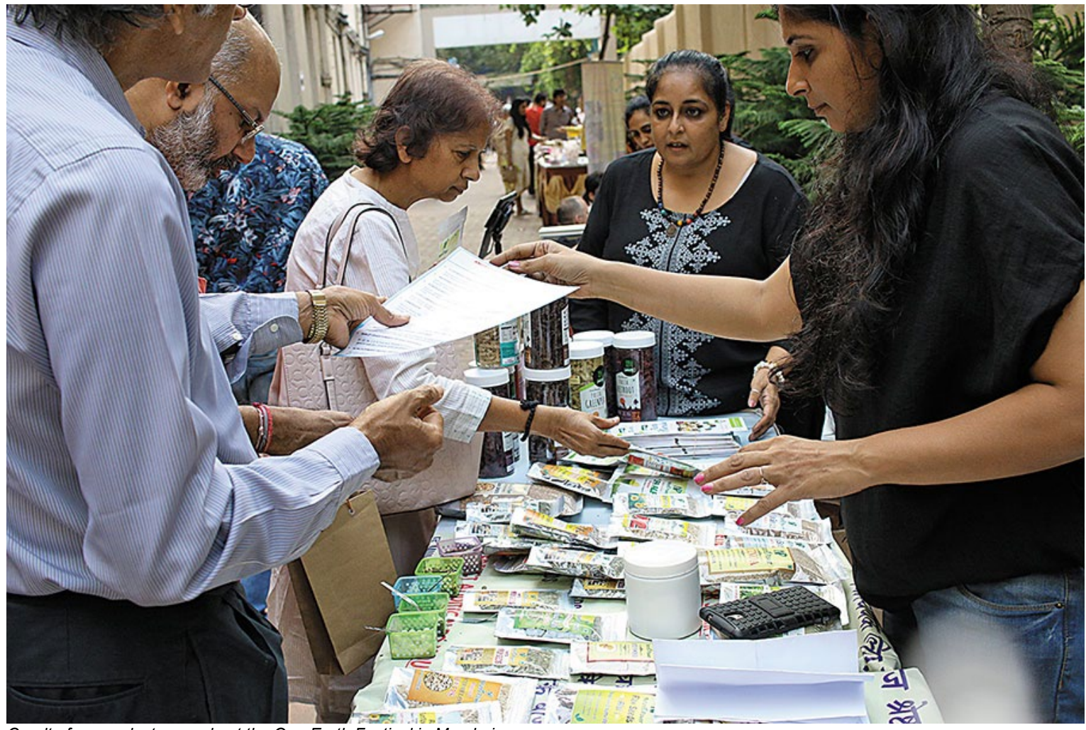
Cruelty-free products on sale at the One Earth Festival in Mumbai